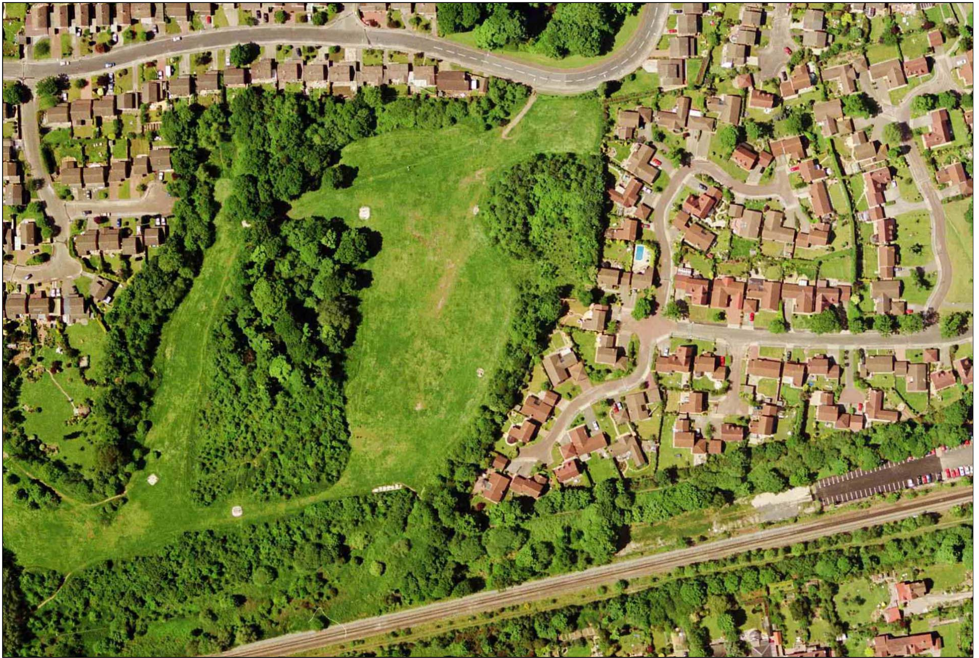
Aerial View of Spital Fields